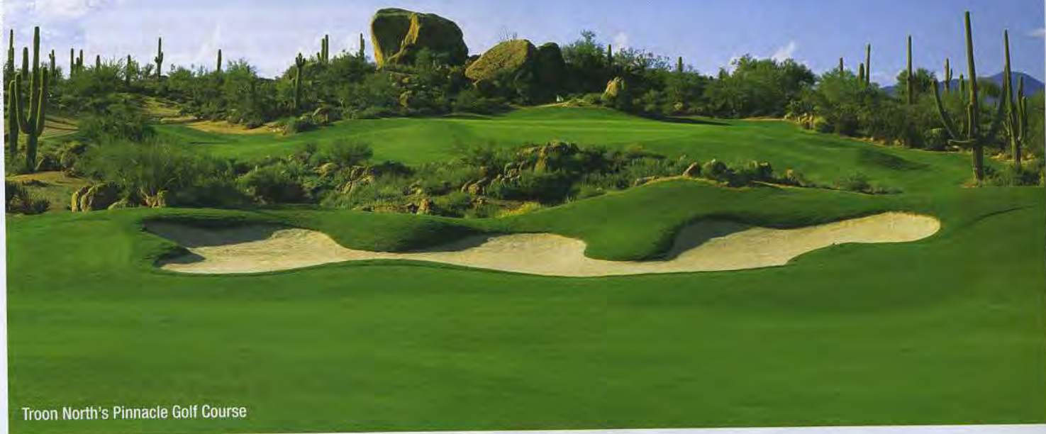
Troon North's Pinnacle Golf Course

cacti that provide great scenery, and there are a few recommended courses strategically located close to Cactus League baseball parks. Maricopa County, which comprises Scottsdale, has more courses than any county in the United States—more than 150.