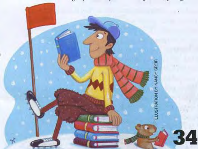
ILLUSTRATION BY NANCY SPEIR

Check out this list of recommended golf books sure to get you ready to tee it up next spring.