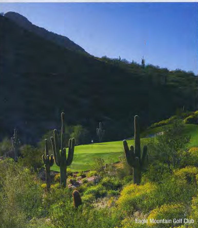
Eagle Mountain Golf Club

Most courses built around this area during the past two decades are "target" courses. To conserve water, they are designed with strategic grass areas that leave a lot of raw desert as hazard. Phoenix is surrounded by mountain foothills and giant Saguaro