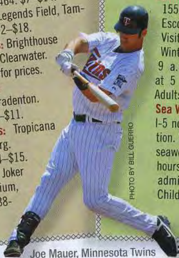
Joe Mauer, Minnesota Twins

Detroit Tigers: Joker Marchant Stadium, Lakeland. 686-688-8075. $7-$16.