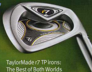
TaylorMade r7 TP irons: The Best of Both Worlds